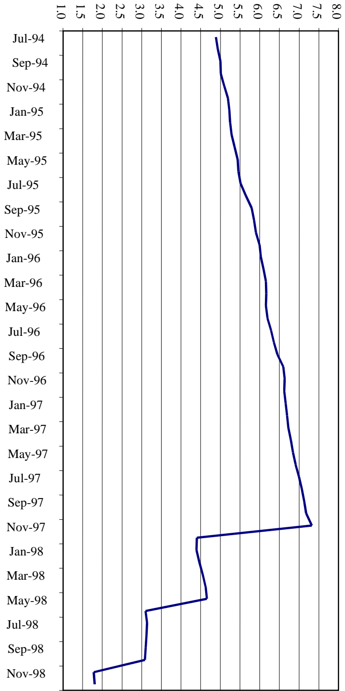
Figure 3. State Bonds (as % of GDP)